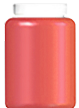
WIDE CONTAINER SLEEVE