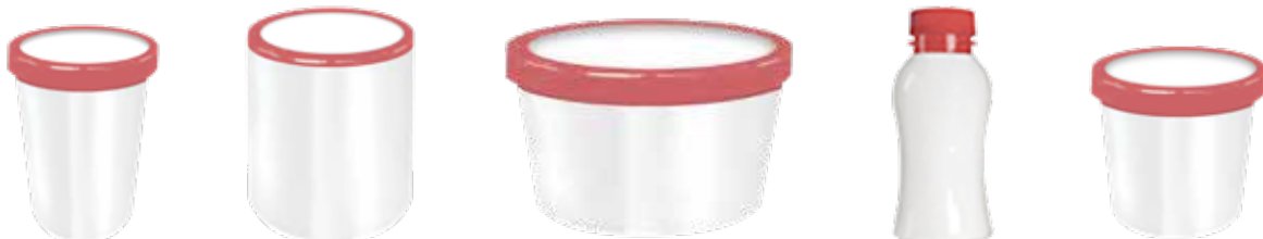
TAMPER EVIDENT BANDS