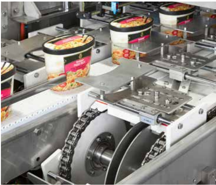
Dynamic Platen - Provides 360° of Shrink Band