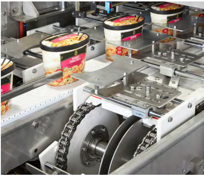
Dynamic Platen - Provides 360° of Shrink Band