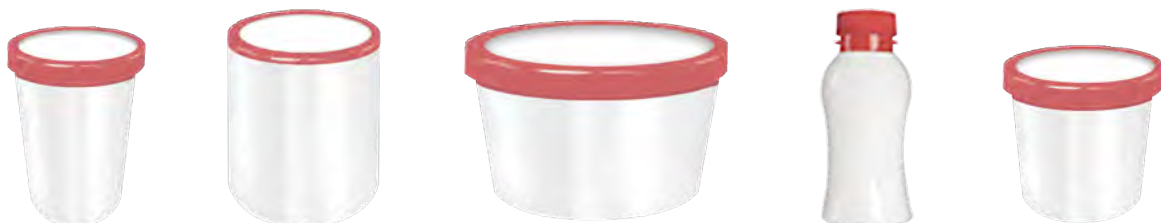
TAMPER EVIDENT BANDS