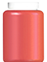
WIDE CONTAINER SLEEVE