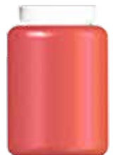
WIDE CONTAINER SLEEVE